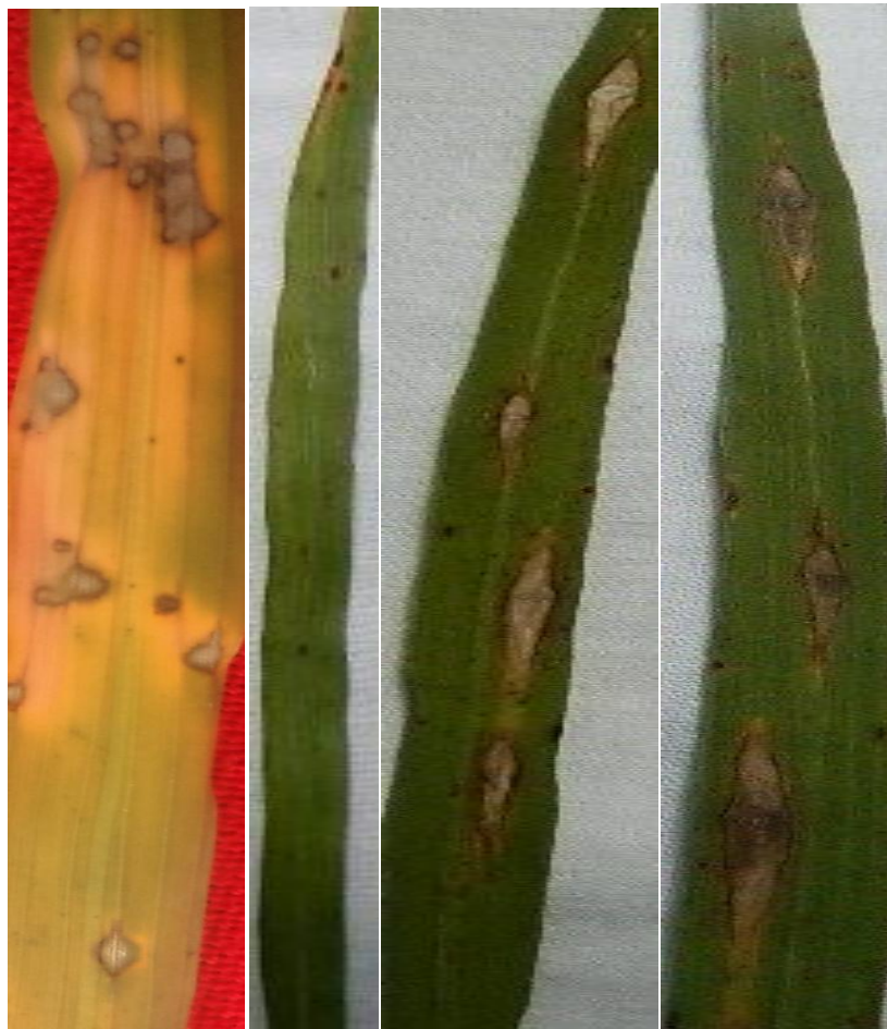
Plate. 1. Different types of blast symptoms observed during race identification