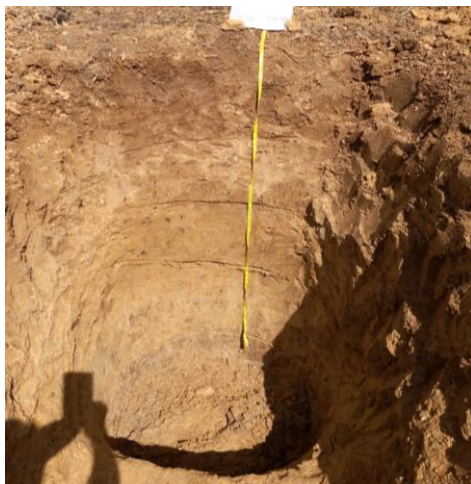
Plate 2. ( Haplustalfs )