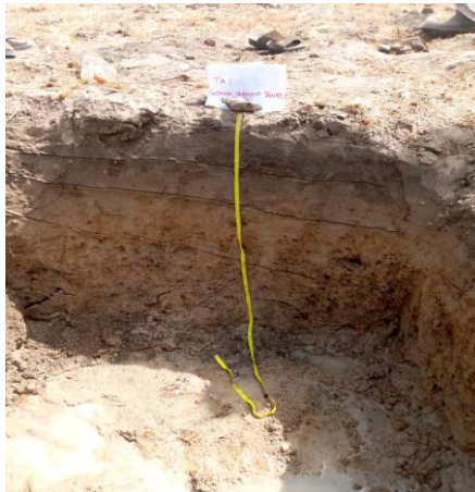
Plate 1. ( Haplustepts )

The morphological properties of the soils are presented in Table 1. The soil of all the pedons are generally deep with depth of >50cm. The colour of the soil varied from dark grey (10YR 4/2) at the surface horizon changing to yellowish brown (10YR 4/4) in the subsurface horizon. The texture of the soil varied from loamy sand to sandy loam in the surface horizon changing to loamy sand in the subsurface horizon with distinctive structures ranging from platy, sub-angular blocky and angular blocky. The consistence of the soil varied from hard to very hard; firm, loose and sticky-plastic. The clay content increased with depth which indicates the presence of argillic horizon. The root of the soils varied from many roots changing to medium roots in the surface horizon and very few roots in the subsurface horizons.