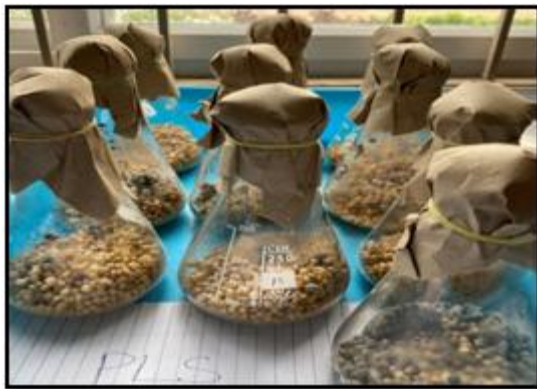
4. Incubation at 25-27 °C