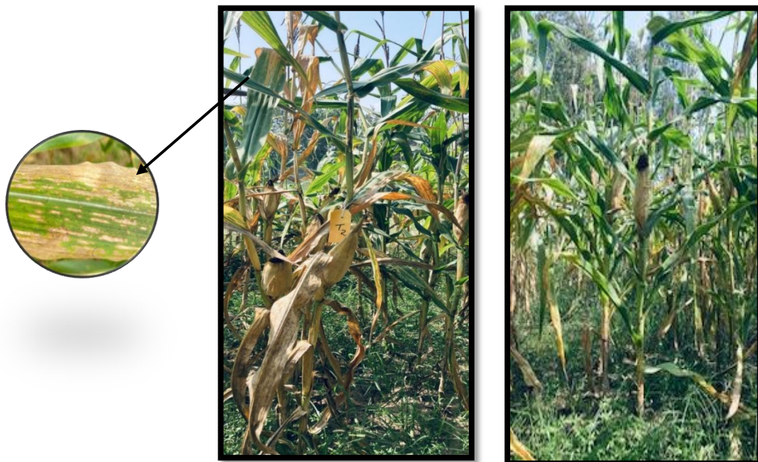
Fig. 3. Inbred lines showing moderately susceptible (BML7) and resistant (VL18828) reaction towards TLB incidence