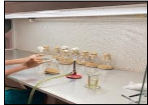
3. Seeded with fungus