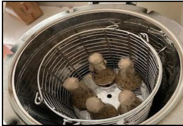
1. Autoclaving of sorghum grains