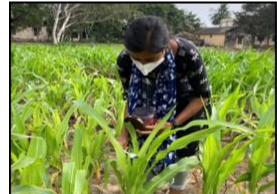
6. Whorl drop inoculation