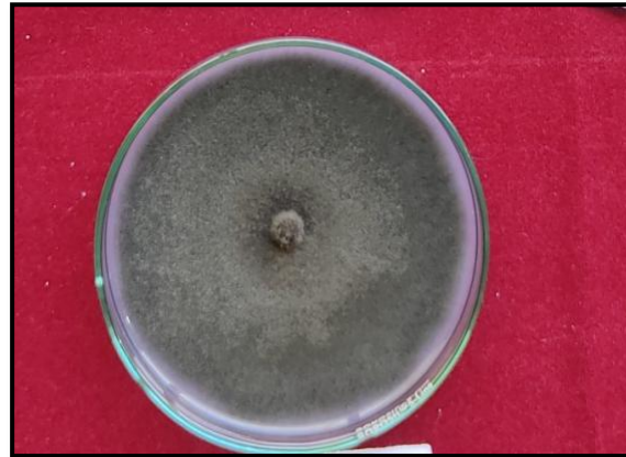
2. TLB Pure culture