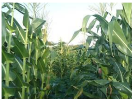
Maize-cow pea intercrop cover

MA= Maize sole planted; MA+SO= Maize + Sonchus intercropped; MA+CO= Maize intercropped with Cowpeas; MA+SO+CO= Maize intercropped with Sonchus and Cowpea