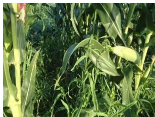
Maize-Sonchus intercrop cover