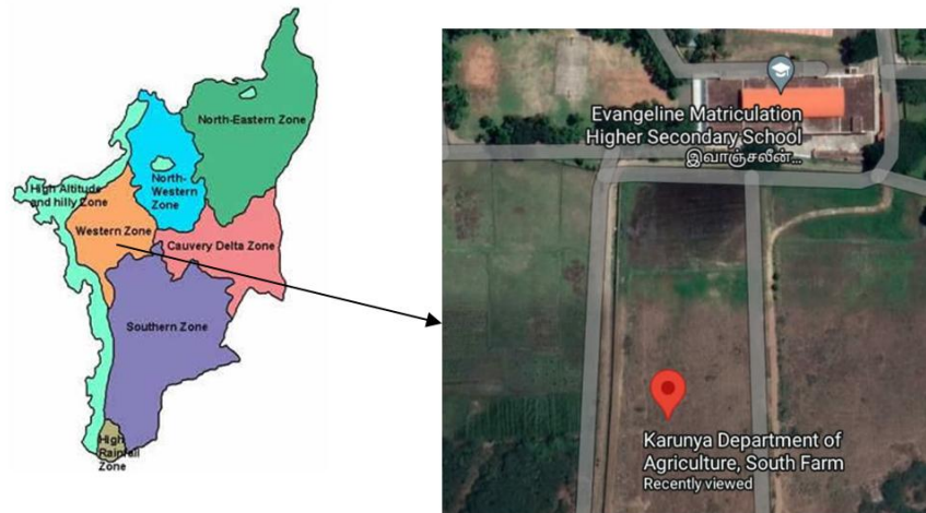
Map 1. Study area