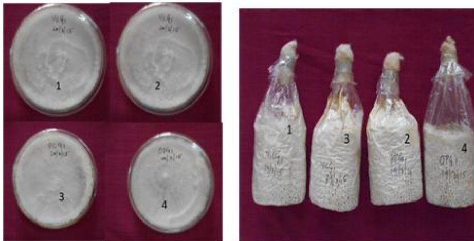
Fig. (2a & 2b). Ganoderma Isolates