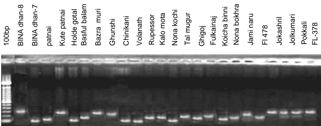
Fig. 3. Banding profiles of 24 rice germplasm using primer RM234