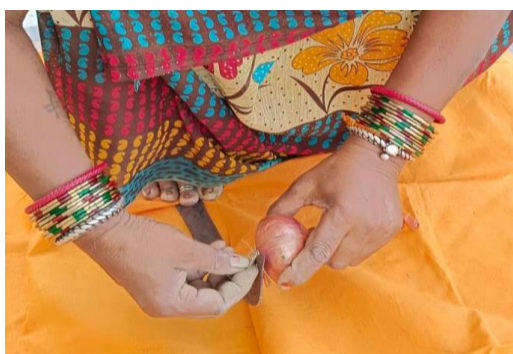
Fig. 2. Manual cutting of onion stem and root (sickle)

Battery operated onion root and shoot cutting machine: This machine consists of blade, DC motor and plates assembly which is mounted on top side of stable platform on frame. It operates on charging spray pump battery. The power operated onion leaf and root cutter is operated by 12 watt single phase DC motor having 150 rated rpm. When power is supplied to the machine, the DC motor turns direct current into mechanical energy, which aids in the rotation of the blade. The blade is inserted between the plates, which include two slots for onion insertion, allowing the roots and leaves to be sliced independently. The onions are inserted in the slots manually, after that the cutting of root and shoot bulb moves downward. On a single machine, two people can cut the leaves and roots at the same time.