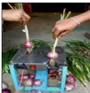
Fig. 3. Battery operated onion root and shoot cutting machine

Battery operated onion root and shoot cutting machine: This machine consists of blade, DC motor and plates assembly which is mounted on top side of stable platform on frame. It operates on charging spray pump battery. The power operated onion leaf and root cutter is operated by 12 watt single phase DC motor having 150 rated rpm. When power is supplied to the machine, the DC motor turns direct current into mechanical energy, which aids in the rotation of the blade. The blade is inserted between the plates, which include two slots for onion insertion, allowing the roots and leaves to be sliced independently. The onions are inserted in the slots manually, after that the cutting of root and shoot bulb moves downward. On a single machine, two people can cut the leaves and roots at the same time.