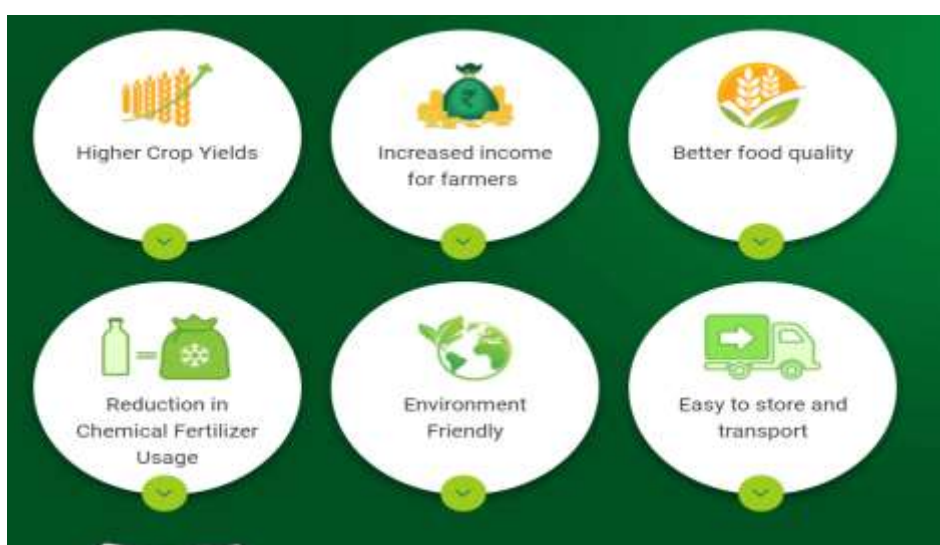
Fig. 2. Benefits of Nano urea

Nano Urea is needed in smaller quantities compared to bulky nitrogenous fertilizers like urea. This has a notable effect on logistics and warehousing costs. Farmers can conveniently carry bottles of Nano Urea instead of heavy bags of conventional urea. Despite the potential benefits, there may be limited long-term research on the effects of nano urea on crop yields, soil health, and overall agricultural sustainability. More extensive research is needed to fully understand its implications.