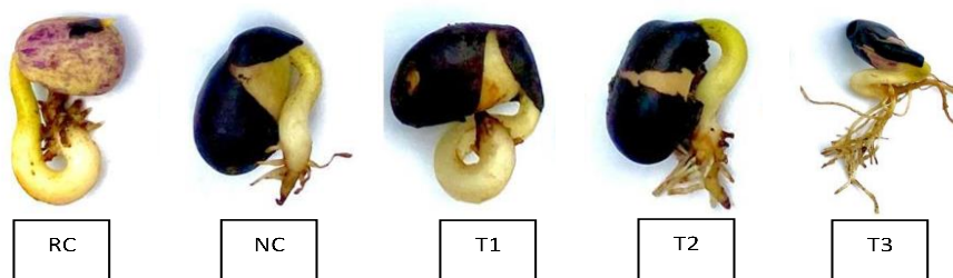
Fig. 1. Effect of Methylobacterium symbioticum and Xanthobacter autotrophicus on germination of Phaseolus vulgaris after 9 days of sowing in soil polluted by 26,990 ppm of waste motor oil

*n=6 **different letters showed statistically different according to ANOVA/Tukey p<0.05%.