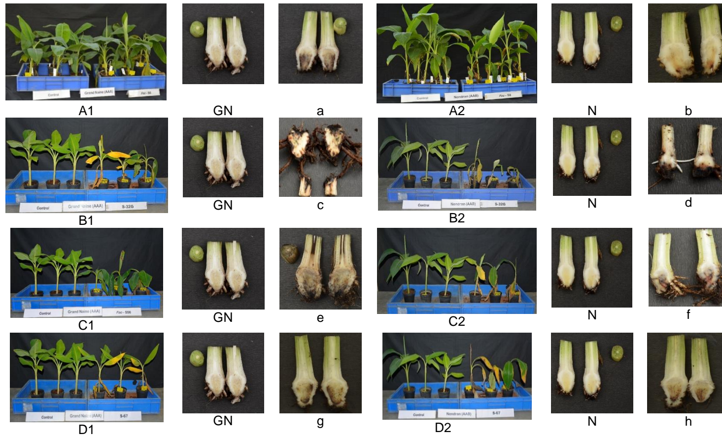
Fig. 2. Pathogenicity assay of different Foc isolates in grand Naine and Nendran

A1, B1, C1, D1 – yellowing and wilting symptoms of Foc isolates S6, S32G, S56, S67 in Grand Naine respectively; A2, B2, C2, D2 – yellowing and wilting symptoms of Foc isolates S6, S32G, S56, S67 in Nendran respectively; GN- control plants of Grand Naine; N- control plants of Nendran; a, c, e, g – vascular discolouration of Foc isolates S6, S32G, S56, S67 in Grand Naine respectively; b, d, f, h - vascular discolouration of Foc isolates S6, S32G, S56, S67 in Nendran respectively