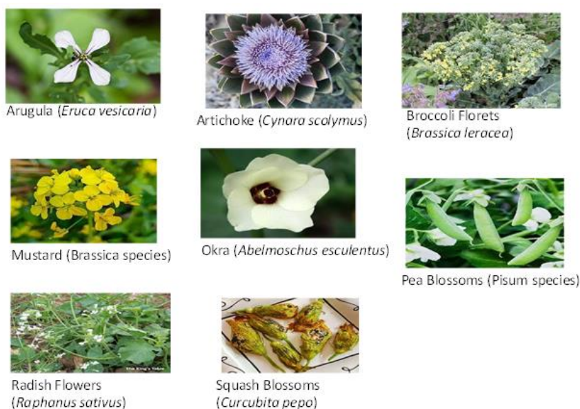
Fig. 2. Common edible ornamental crops