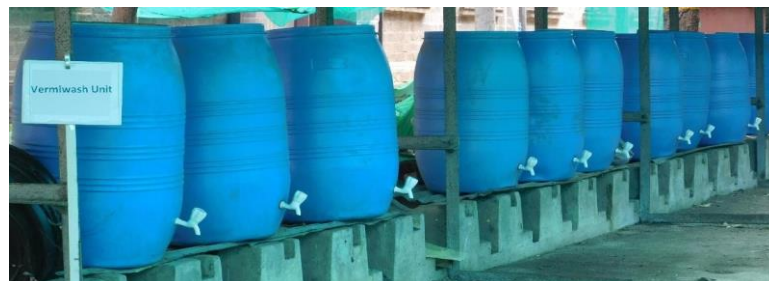
Fig. 3. Vermiwash unit with 200 litre plastic drums

The vermivash drums were filled layer wise (Table 3). After filling vermivash drums, they were allowed for incubation up to 15 days (Fig. 2). The moisture content was maintained 50-55 per cent in the vermivash drums. After 15 days of incubation, 10 liter of water added in