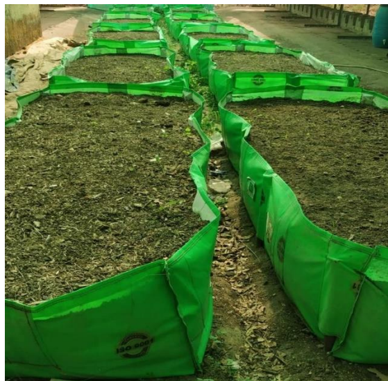
Fig. 2. HDPE vermibeds (12X4X2)