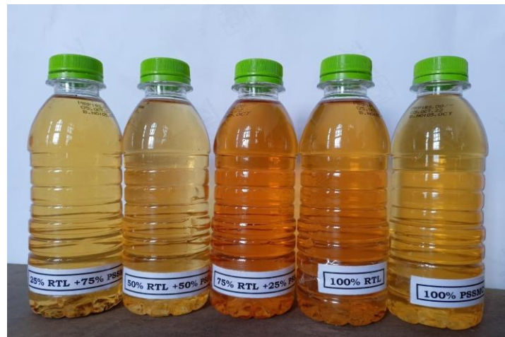
Fig. 6. Vermiwash (first harvest) from different substrates