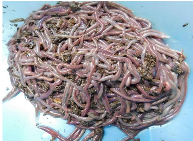
Fig. 1. Earthworms of species Eisenia fetida