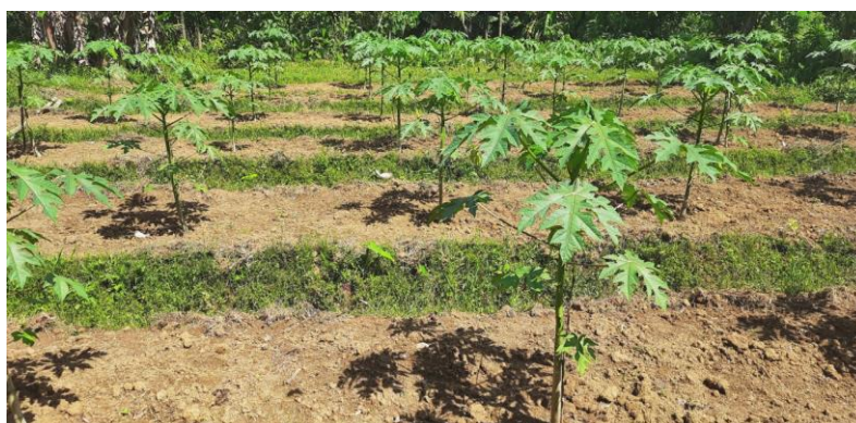
Picture 1. INM plot of papaya

Total yield per plant (kg): For getting total yield per plant, the total number of fruits harvested from individual plant was counted and multiplied it with average fruit weight. It is expressed in kilogram plant -1 .