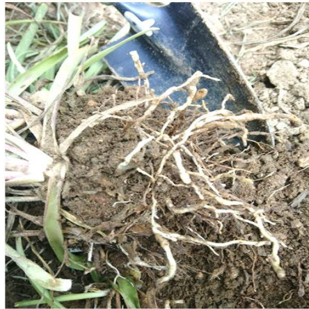
Fig. 1. Infested root of Tuberose