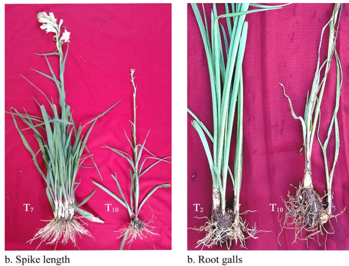
b. Spike length