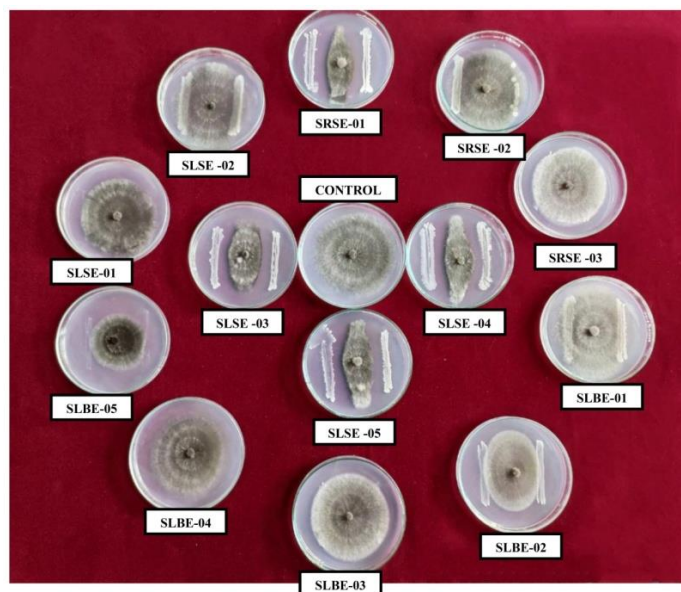
Fig. 1. Screening antagonistic potential bacterial endophytes against E. turcicum In vitro

Three endophytic isolates from the root and ten endophytic isolates from leaves were screened for antagonistic potential against E. turcicum . All endophytic isolates exhibited inhibitory activity against the pathogen compared to the monoculture plate, with inhibition percentages ranging from 3.30 to 52.75 %. Very limited inhibition was observed in SLBE-03 (3.30 %), SLBE-01 (4.95 %), SLSE-01 (6.59 %), SRSE-02 (6.59 %), SRSE-03 (6.59 %), SLSE-02 (8.79 %), SLBE-04 (23.63 %), SLBE-02 (24.18 %) and SLBE-05 (25.27 %). In contrast, isolates demonstrating more than 50% inhibition included SLSE-03 (50.00 %), SLSE-05 (51.10 %), SLSE-04 (51.65 %) and SRSE-01 (52.75 %). Of all the isolates, endophyte SRSE-01 was found significantly superior to other endophytes isolated from healthy leaf bits, root sap and leaf sap. Among the endophytes from leaf bits SLBE-05 was found superior in inhibiting the pathogen (25.27%). Endophytes from leaf sap, i.e., SLSE-04, 05 and 03 were found on par with each other and superior over endophytes from leaf bits in inhibiting the pathogen. Therefore, based on their inhibition percentage the three most superior isolates SLSE-04, SLSE-05 and SRSE-01 were selected for further studies.