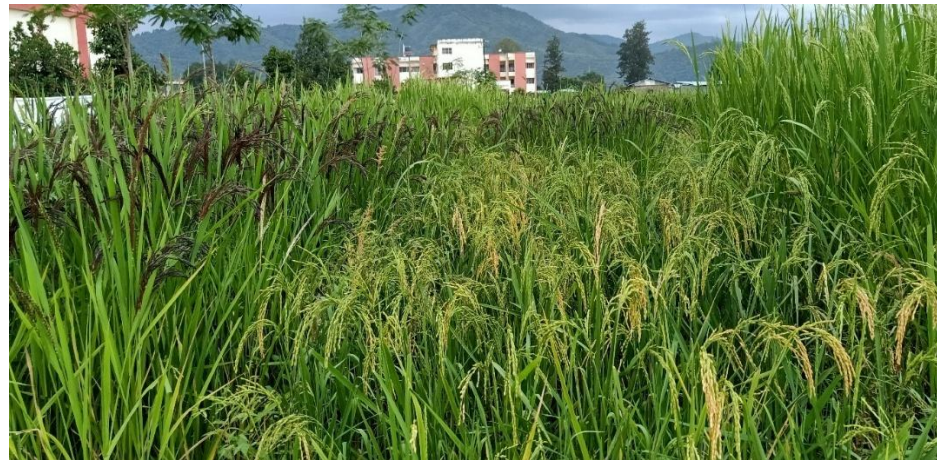
Fig. 2. Different varieties of rice cultivar in the experimental plot